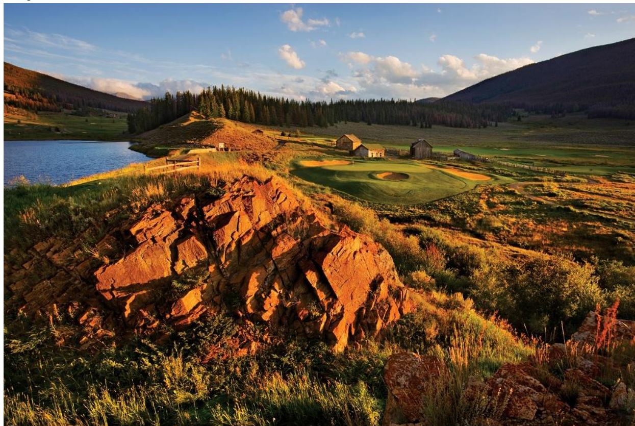
Keystone Ranch Golf Course #5

Keystone Resort offers two magnificent golf courses, Keystone Ranch Golf Course and The River Course at Keystone. Keystone Ranch Golf Course , designed by Robert Trent Jones, Jr. , follows the legendary links-style of a Scottish course on the front nine, while the back nine presents a traditional mountain valley layout. This challenging 7,090-yard, par-72 course winds through lodgepole pines, around sage meadows and across a nine-acre lake, and features slight elevation changes, many bunkers, and panoramic views of the surrounding mountains. Keystone Ranch is also home to the critically acclaimed Keystone Ranch Restaurant. The Keystone Ranch Restaurant is an AAA Four-Diamond rated restaurant, a Wine Spectator DiRoNa winner, and has been recognized by the prestigious Zagat Survey as the Best Restaurant in Colorado. It is the perfect venue for a romantic dinner or for your après golf festivities.